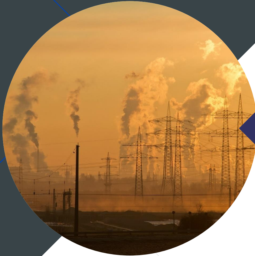
Pollution and CO 2 near metropolitan areas

Through innovation, CAM has successfully turned the tables